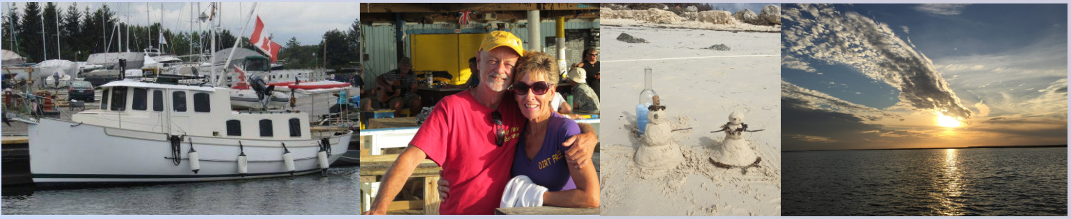
Breakwall just outside the entrance